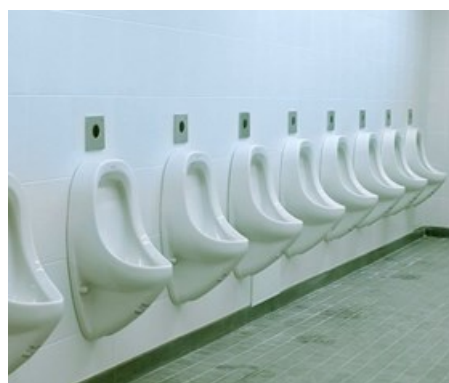
Sanitation facility – Urinals