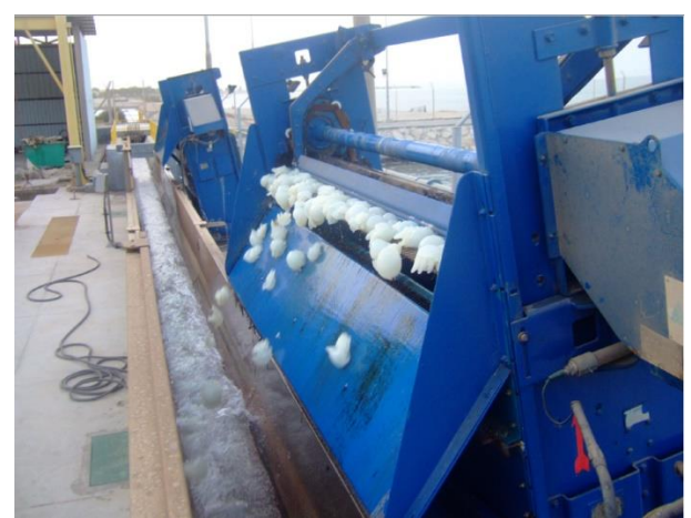
Figure 3. Power and MSF-Desalination Plant - Qurrayah, Kingdom of Saudi Arabia. Upgrading with 20 Revolving Chain Screens (by Aqseptence Group), thus removing up to 60 t/h jellyfish per machine out of sea at a total flowrate of 700,000 m3/h; material of construction of submerged parts is 316L with impressed current cathodic protection

Figure 2. KPONE Independent Thermal Power Station was constructed to improve the distribution of electricity throughout Ghana. The power plant is a 340 MW CCGT thermal power plant. Cable-Operated Bar Screening Machines and Zero-Carryover through flow MultiDisc machines (both by Aqseptence Group) were selected to screen the cooling water through 4 channels, each with 15,000 m<sup>3</sup>/hr; material of construction is 316L with impressed current cathodic protection Due to the use of the state-of-the art maintenance-friendly water-based cooling instead of air cooling in this climate region, a 3-5 % higher energy efficiency rate of the power plant could be achieved. [3] (S.11 et seqq.)