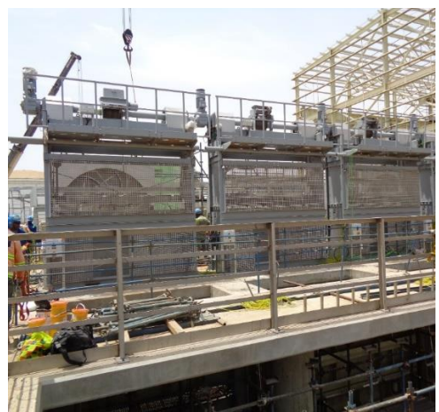
Figure 4. Desalination Plant, Barka 4 IWP, Oman. 3 x Zero-Carryover through flow machines (by Aqseptence Group, called MultiDisc) in combination with Cable-Operated Bar Screens 13,600 m<sup>3</sup>/h per channel; material of construction is mainly Duplex combined with a with impressed current cathodic protection