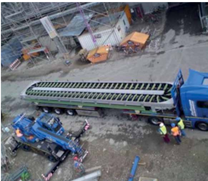
GKM 9 Power Plant, Mannheim, Germany