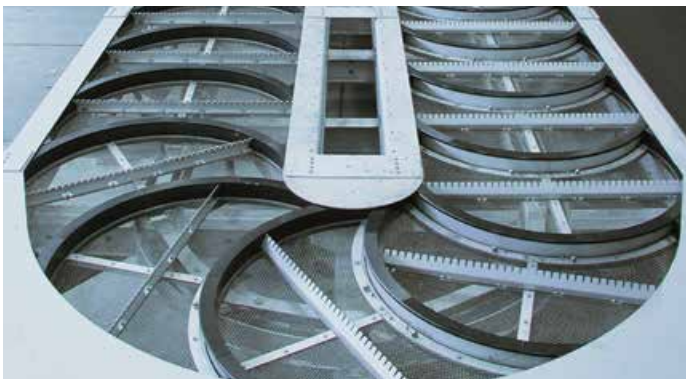
Geiger MultiDisc® Travelling Water Screening Machines