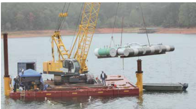
Johnson Offshore Intake Systems™ (JOIS™) Installation