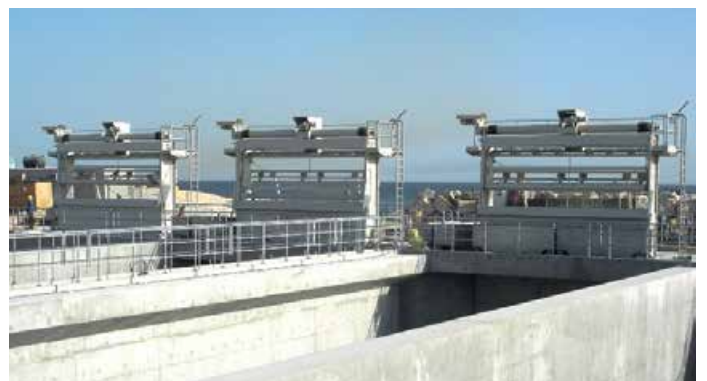
Geiger® Cable-Operated Grab Cleaner