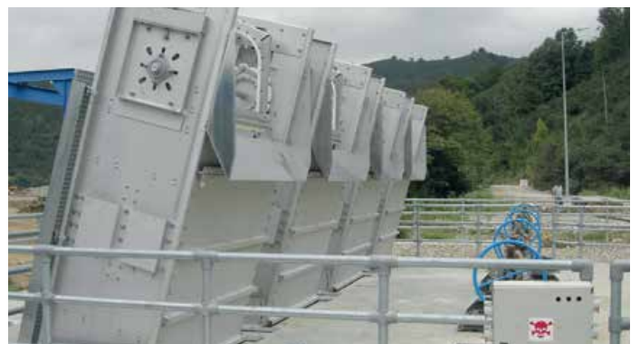
Geiger® High-Capacity Revolving Chain Screen