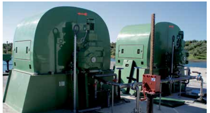
Geiger® Travelling Band Screens