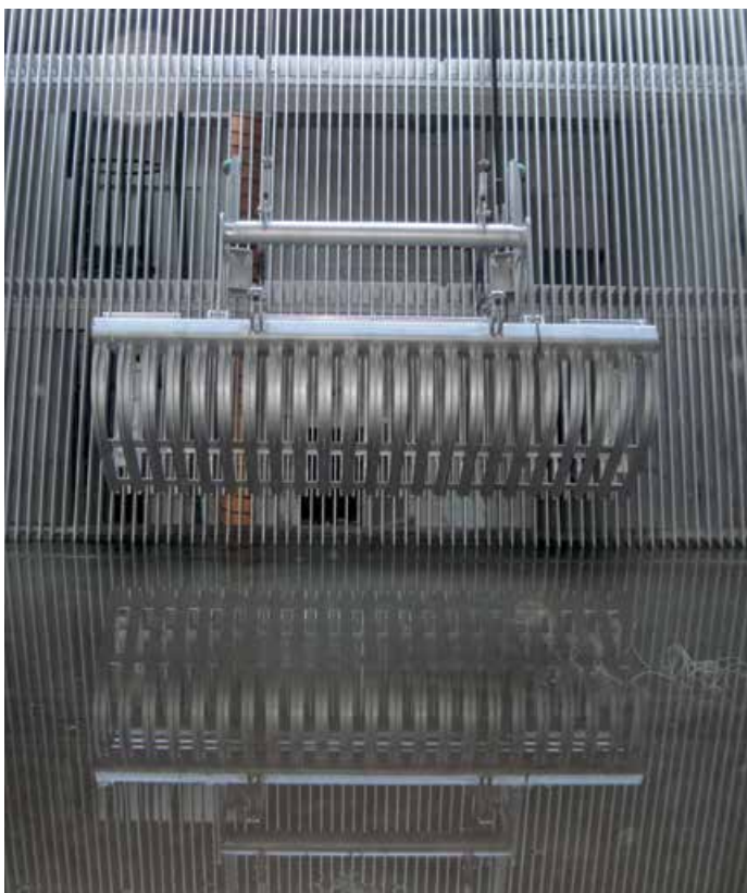
Geiger® Claw Screen