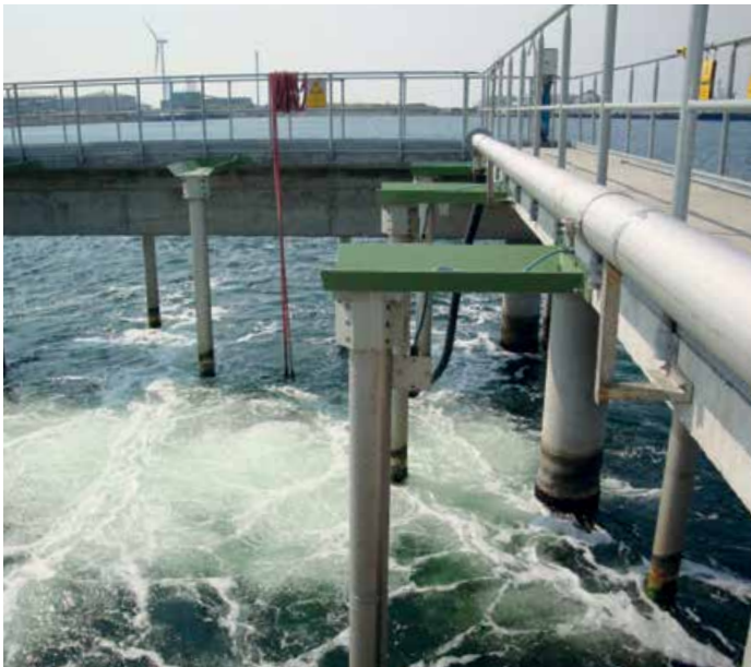
Geiger® Fish Repelling System