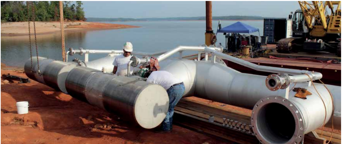
Johnson Screens® Passive Intake Installation: Drinking Water Plant, in South Carolina, USA