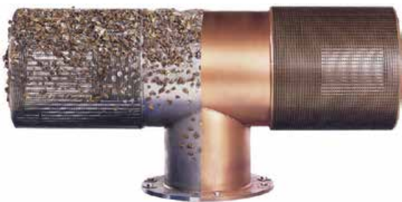
Johnson Screens® Passive Intake Screen (half stainless steel (left side), half Z-Alloy (CuNi) (right side))

With time, general debris will gather on the outer screen surface and will need periodic cleaning to keep the screen functioning continuously and properly. Our Hydroburst™ system offers an efficient method of regular cleaning without having to send divers in to clean the screens. Our Hydroburst™ system is designed to deliver a sufficient volume of air in 3-5 seconds time – a real solid blast of air that has proven to work in all types of applications and conditions. This volume of air comes out from the bottom of the screen, and as it rises and expands, grabs and carries impinged debris away from the screen surface, returning the screen to a clean operating condition. Our application engineers evaluate screen size, depth and distance away in order to deliver the correct amount of air. Systems can be as basic as operating a manual valve, a programmable timer system or to a PLC system that communicates to a central data control system/SCADA system for control.