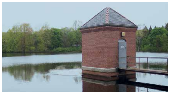
Hydroburst™ with Surface Blast