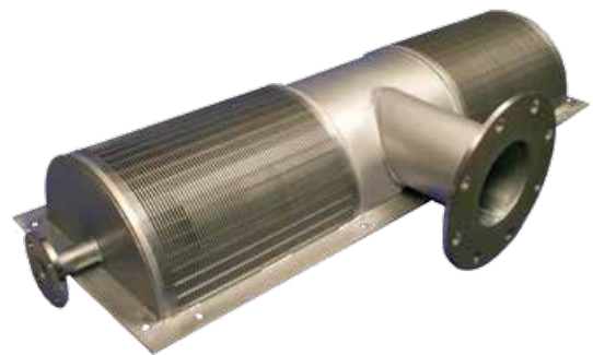
Johnson Screens® Half Intake Screen