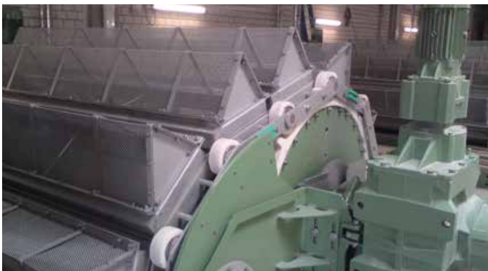
Geiger® Centre-Flow Travelling Band Screen