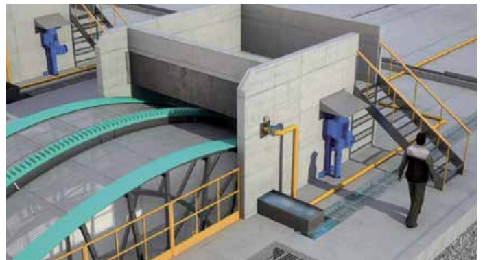
Geiger® High-Capacity Drum Screens