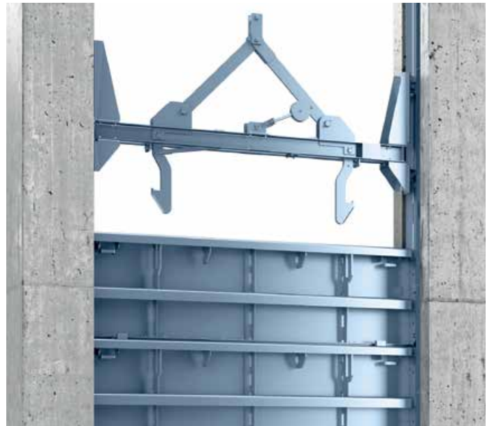
Geiger® Stop Log with Lifting Beam