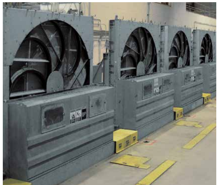
DC Cook Nuclear Power Plant, USA