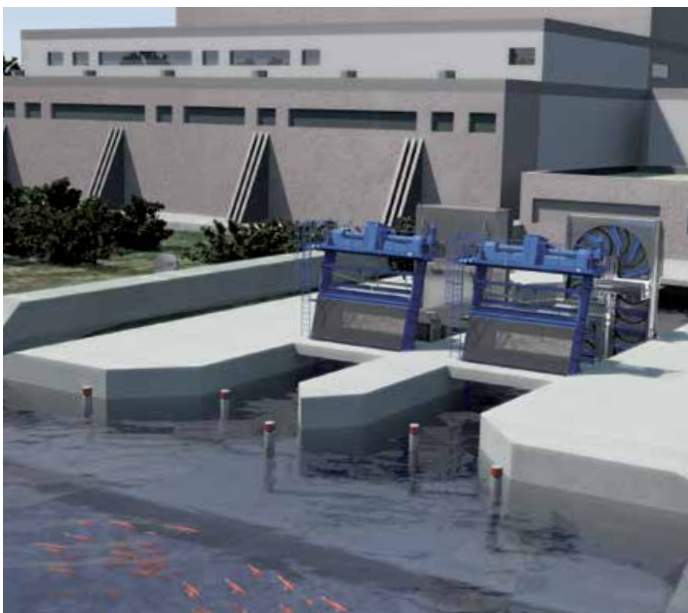
Two Channel Water Intake with Geiger® Fish Repelling and Geiger® Fish Return System