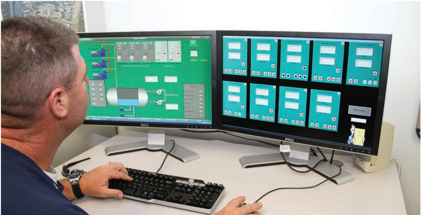
CONTROL CENTER – One person can control most aspects of Oak Island’s vacuum sewer system from a central command center. Here, the operator can see the status of each of the city’s nine vacuum stations and make adjustments to any one of them.