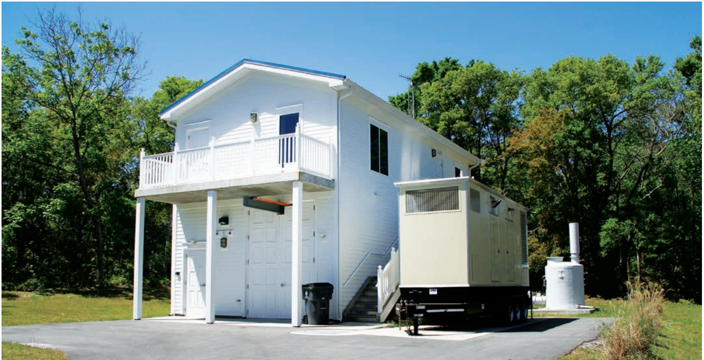
VACUUM STATION – This is one of Oak Island’s nine vacuum sewer stations. In the event of a power outage, the stations can be powered by a portable generator (shown here).